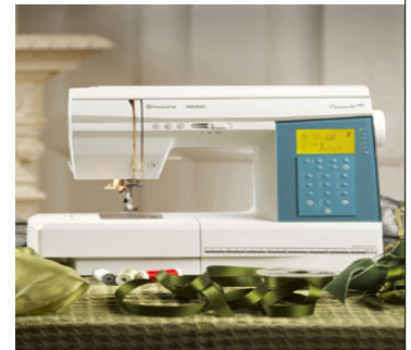
Emerald 183 £499.00

Up to £100.00 part exchange off the retail price