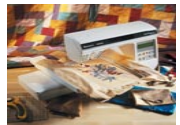
Quilt Designer II