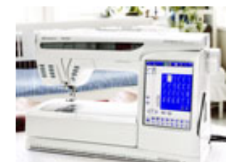
Designer SE £4495.00