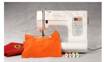
Huskystar EM10 RP £599.00