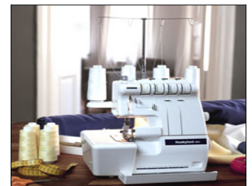
Huskylock 901 RP £249.00

Up to £100.00 part exchange off the retail price